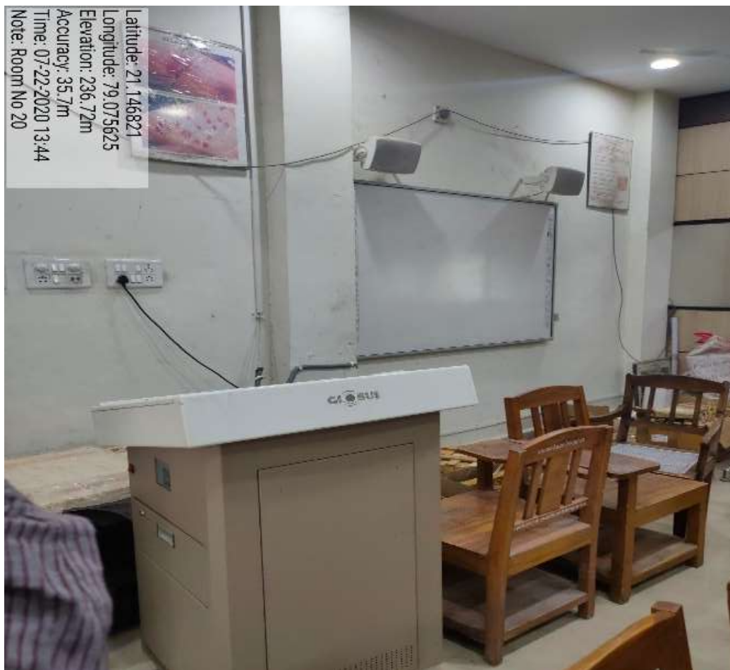
Central Instrumentation Laboratory (N-1)

Latitude: 21.146821 Longitude: 79.075625 Elevation: 236.72m Accuracy: 35.7m Time: 07-22-2020 13:44 Note: Room No 20